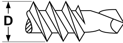
Fine Thread Drill Point Drywall Screw